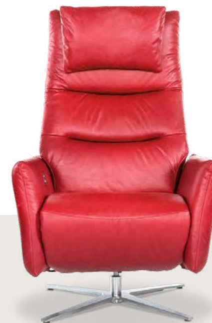
Cover: Z62/14 rosso

This chair is a highlight in each room due to its quilted back. At first sight you will not notice something special – but once you sit down you will discover the back and armpart function which gives you a perfect comfort feeling as an option. The noble swivel base is available in different metal colours.