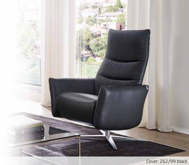
Cover: Z62/99 black