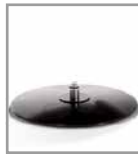
wooden base - diff. stain shades - FU 3., surcharge F U3.