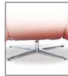
cross metal leg, nickel glazed steel - FU 4., surcharge F U4.