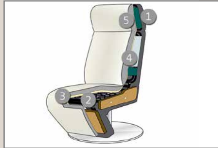
The design of the cross section shown here does not correspond to the model on this page of the catalogue.