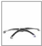
five spoke metal leg high-gloss chrome - FU 1 F U1