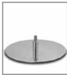
turntable leg - diff. metal colours - FU 2., surcharge F U2.