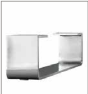
Metal runner high-gloss chrome