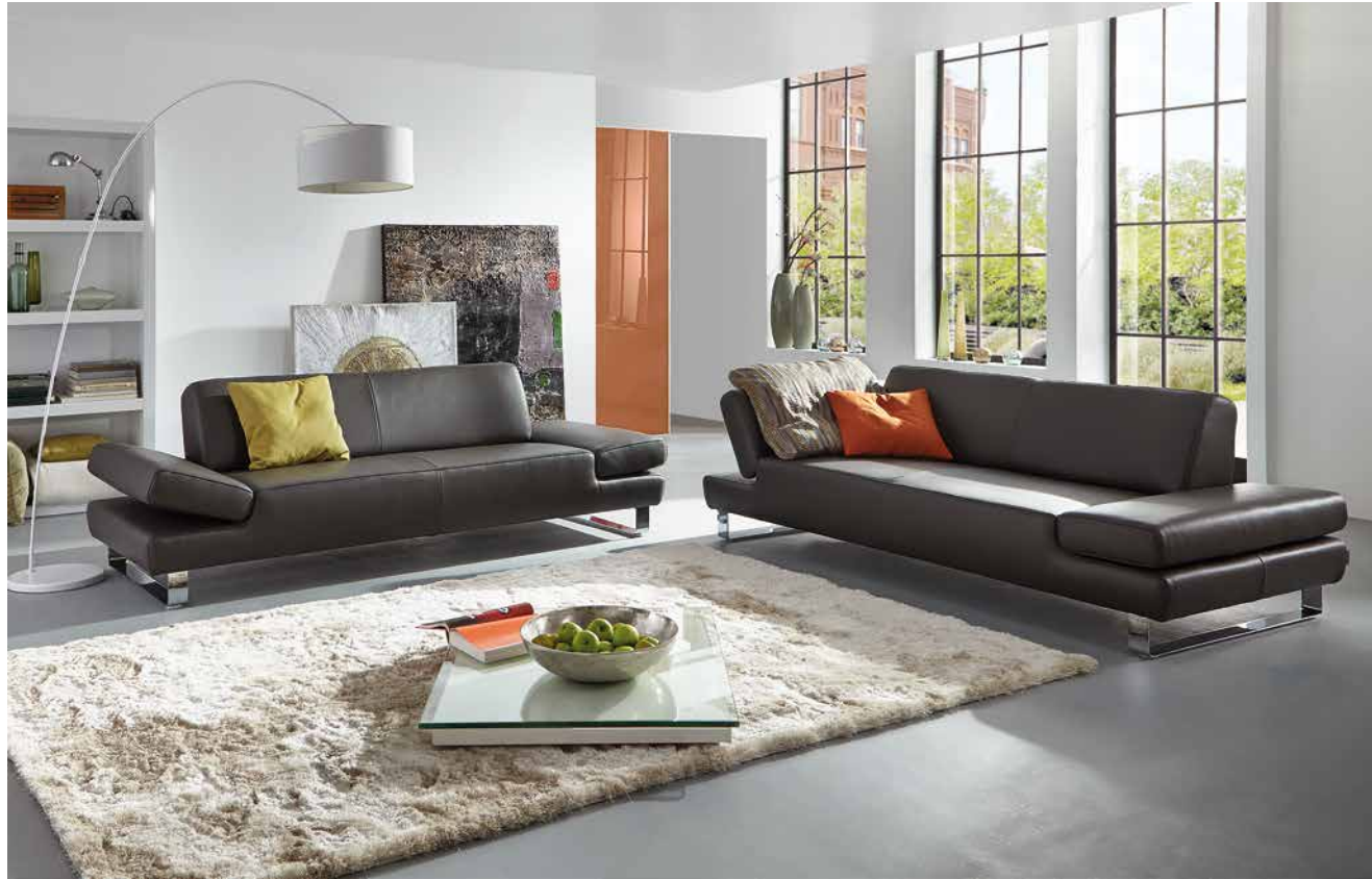
Cover: Z77/95 graphite