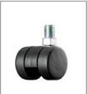
plastic double castor (2 cm taller)