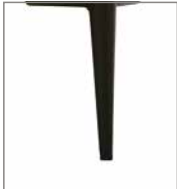
metal leg black