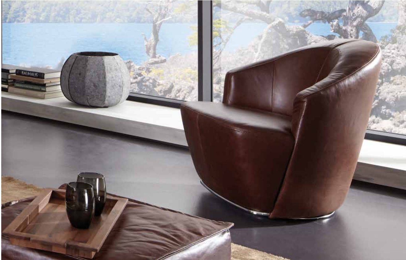
Cover: Z69/50 cognac