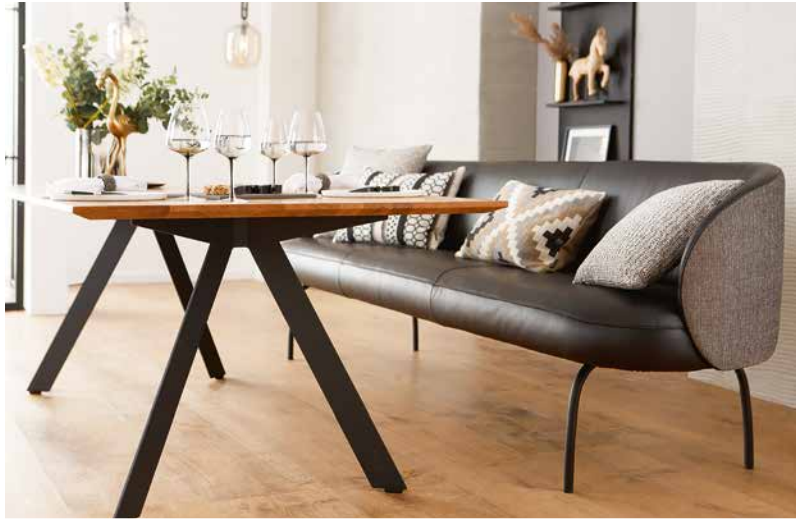
Cover: outer back and armparts V39/97 black and white; inner back and armparts, seat Z73/99 black star