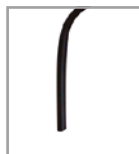
metal leg diff. metal col.