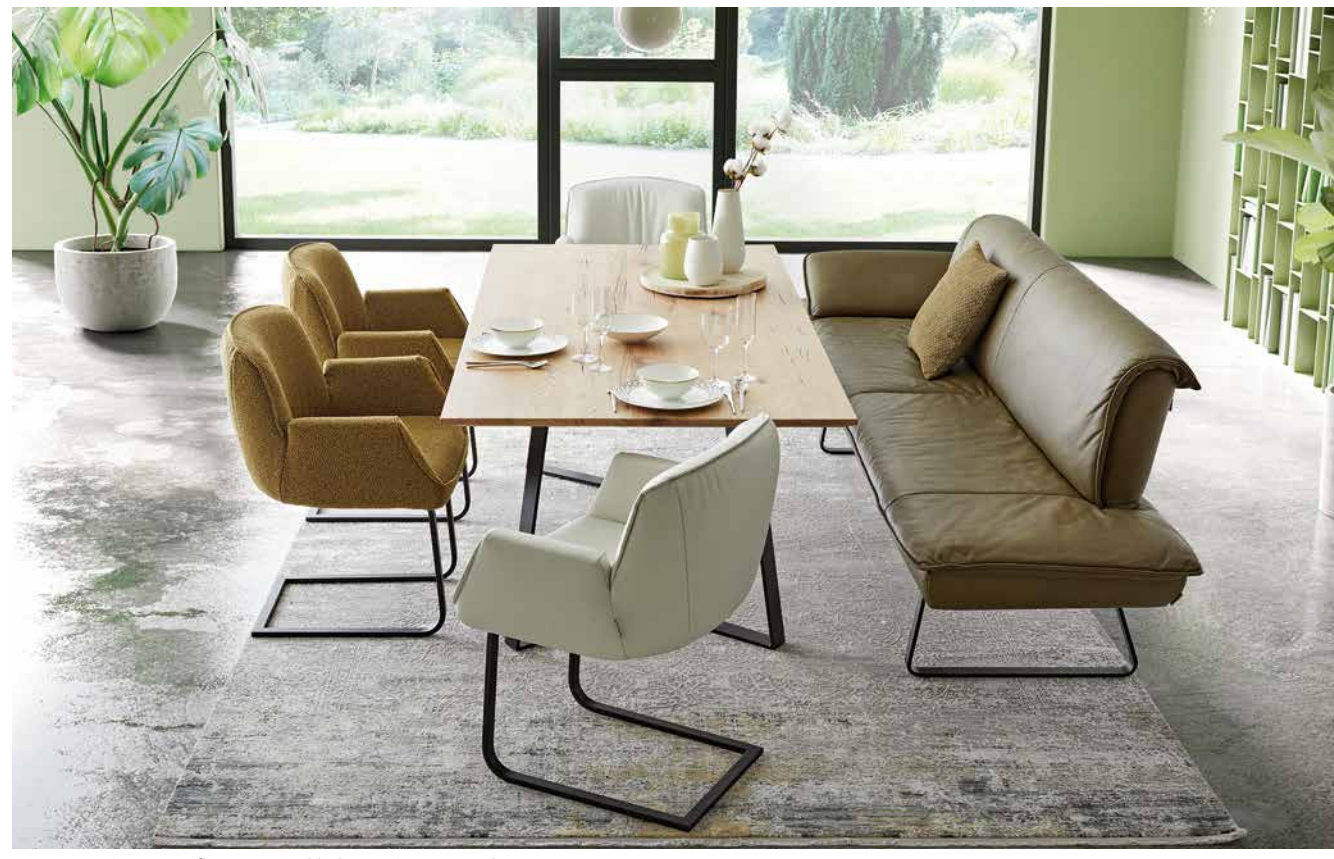
Covers: Z69/36 camouflage, O10/34 khaki, Z73/43 cream white