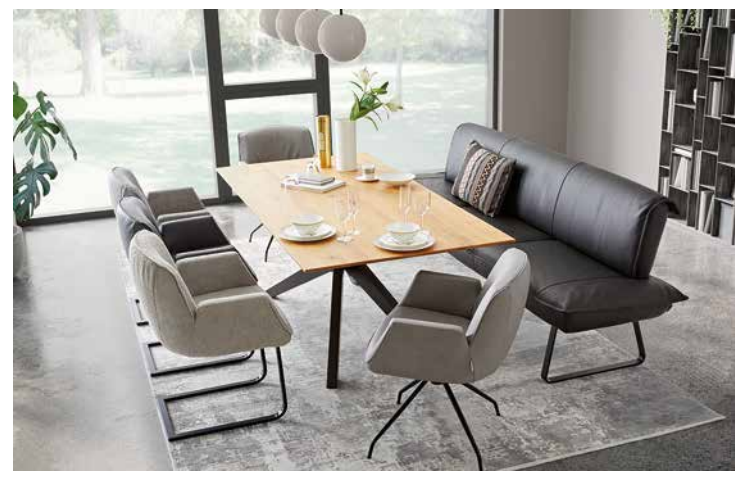
Covers: Z77/99 black pearl, S43/22 granite, V86/21 silver, V85/98 midnight