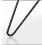
hair pin frame black powder-coat.