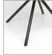
quadpod leg fixed black