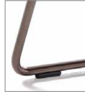
tube-wire frame black powder-coat.