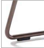
tube-wire frame black powder-coat.