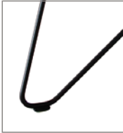
hair pin leg black powder-coated